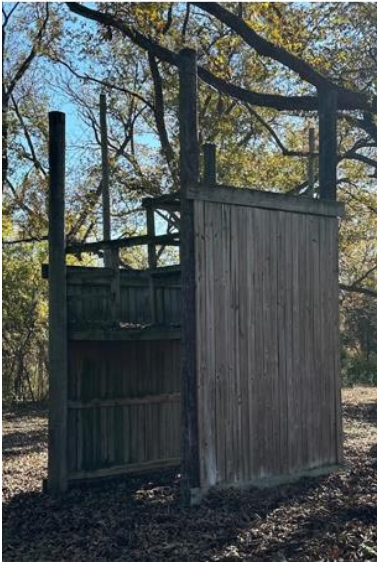
North Wall: construct third wall surface